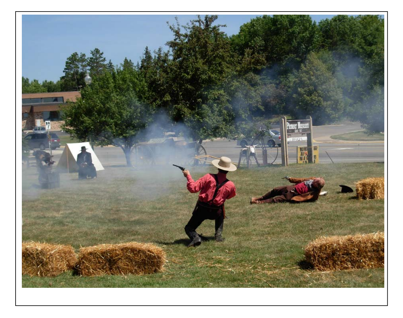
A scene from one of the shootouts on the Museum grounds at Wild West Day.