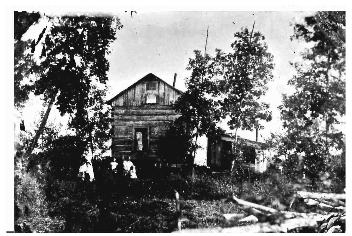
Turnham's cabin, about 1870

For the first settlers of Minnesota it would be hard to overemphasize the convenience of having a spring on your own land that could provide a steady supply of pure, cold water. It could be used not only for drinking water for the family and their livestock, but also used for keeping their meat and milk from spoiling during the hot summer months. There were a number of springs around the Lake Minnetonka area but the one that directly affected my pioneer ancestors was the one located along the creek that flows from Clasen Lake to Stubbs Bay and is about 200 yards southeast of the intersection of Watertown Road and Leaf Street. Originally this was part of the homestead of my great-grandparents, Edwin and Emily Maxwell Turnham who had claimed the land in 1855, the year this part of Minnesota had been opened for settlement.