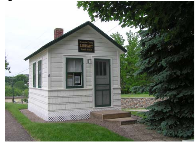
Hamel Library Museum

The Hamel Library Museum certainly fits the old adage, "good things come in small packages"!